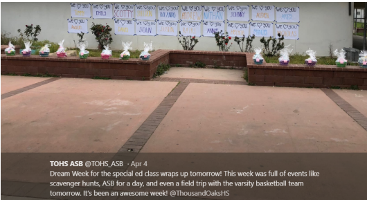
TOHS ASB @TOHS_ASB - Apr 4 Dream Week for the special ed class wraps up tomorrow! This week was full of events like scavenger hunts, ASB for a day, and even a field trip with the varsity basketball team tomorrow. It's been an awesome week! @ThousandOaksHS

Being a Lancer means being part of our community.